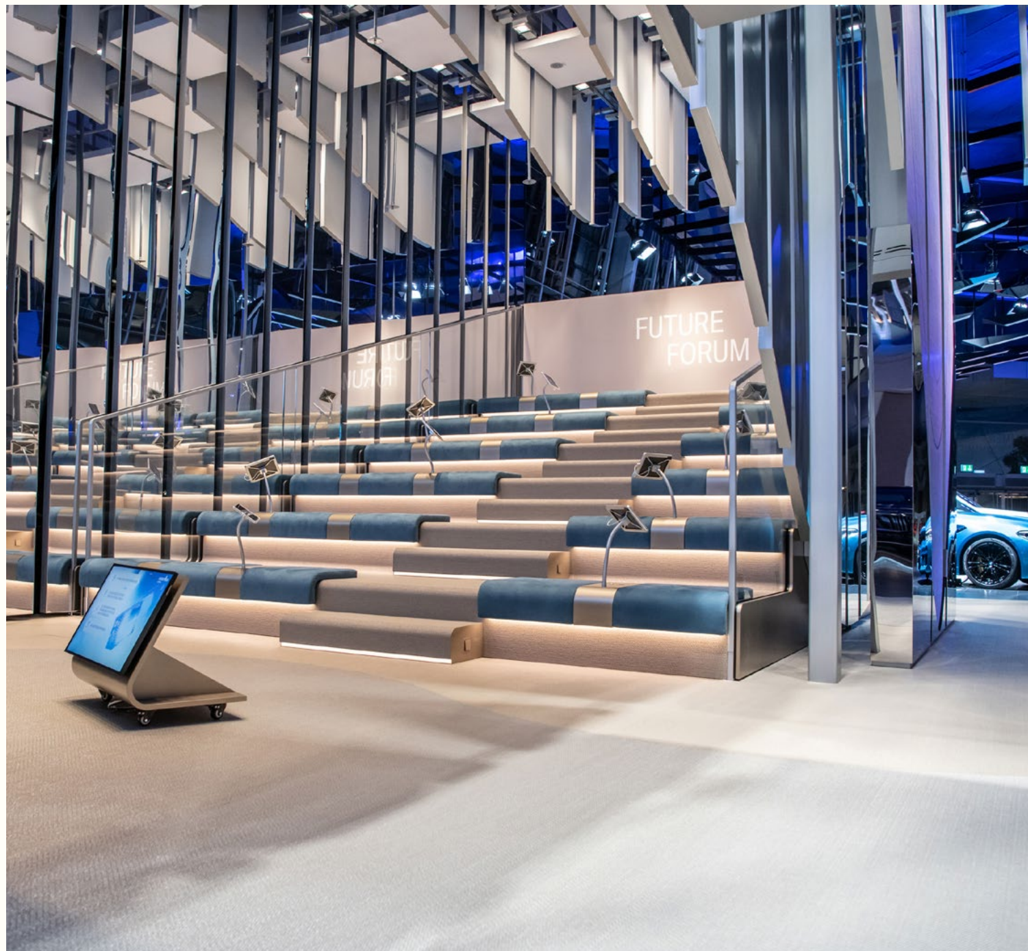
BMW FUTURE FORUM / Cologne, Germany