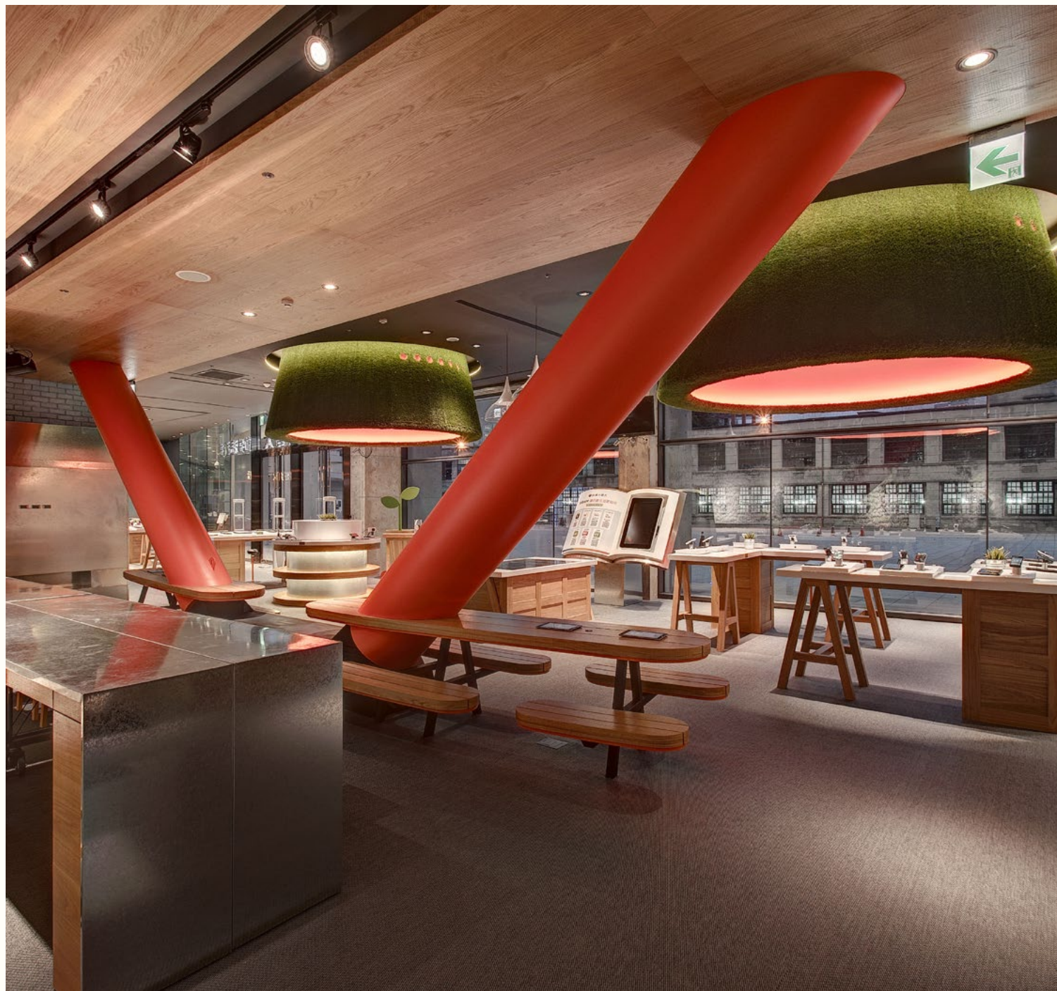
MOBILE DIGITAL LIFE HALL / Taipei, Taiwan